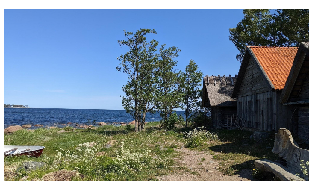
Estonia - Lake Peipsi