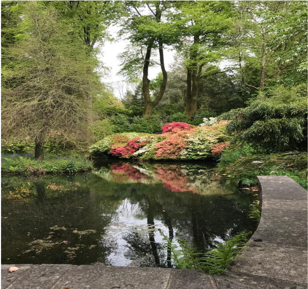
Lukesland Gardens 13.5.22